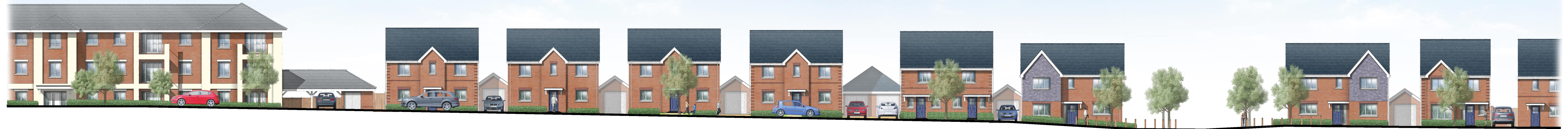
Block 3 Plots 139-152 House Type Quilter Plot 138 House Type Quilter Plot 137 House Type Quilter Plot 136 House Type Quilter Plot 135 House Type Potter Plot 134 House Type Potter Plot 133 House Type Milliner Plot 132 House Type Milliner Plot 80 House Type Scrivener Plot 79 House Type H30 Plot 78

NOTE: Ground levels and finished floor levels are indicative only and subject to engineers' detailed design.